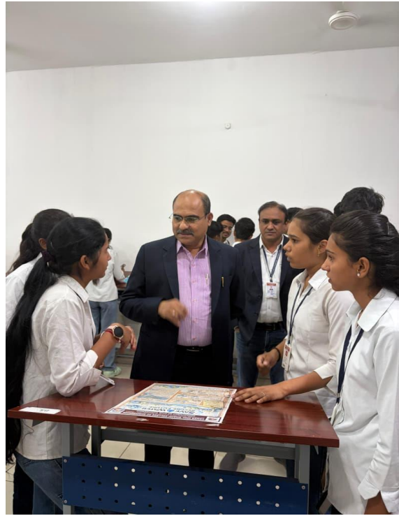
Photo taken at Poster Competition held on the eve of World Water Week 2026 celebration on 28-3-2026.