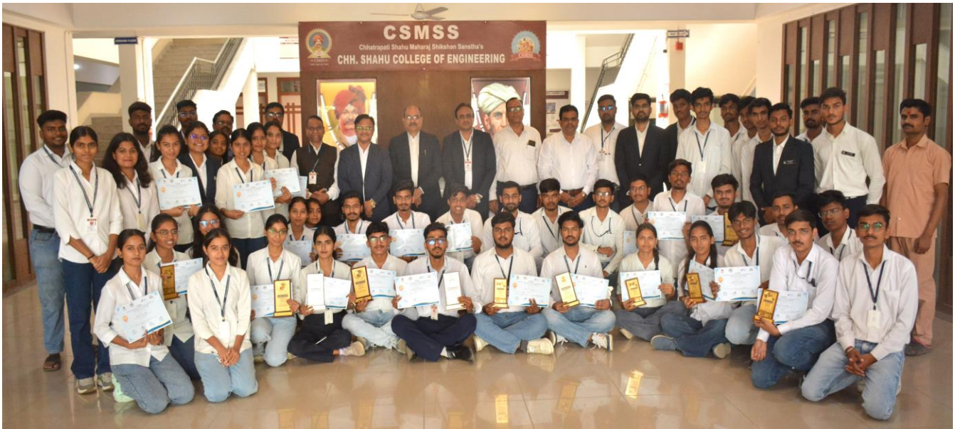
Group Photo taken on the eve of World Water Week 2026 celebration on 28-3-2026