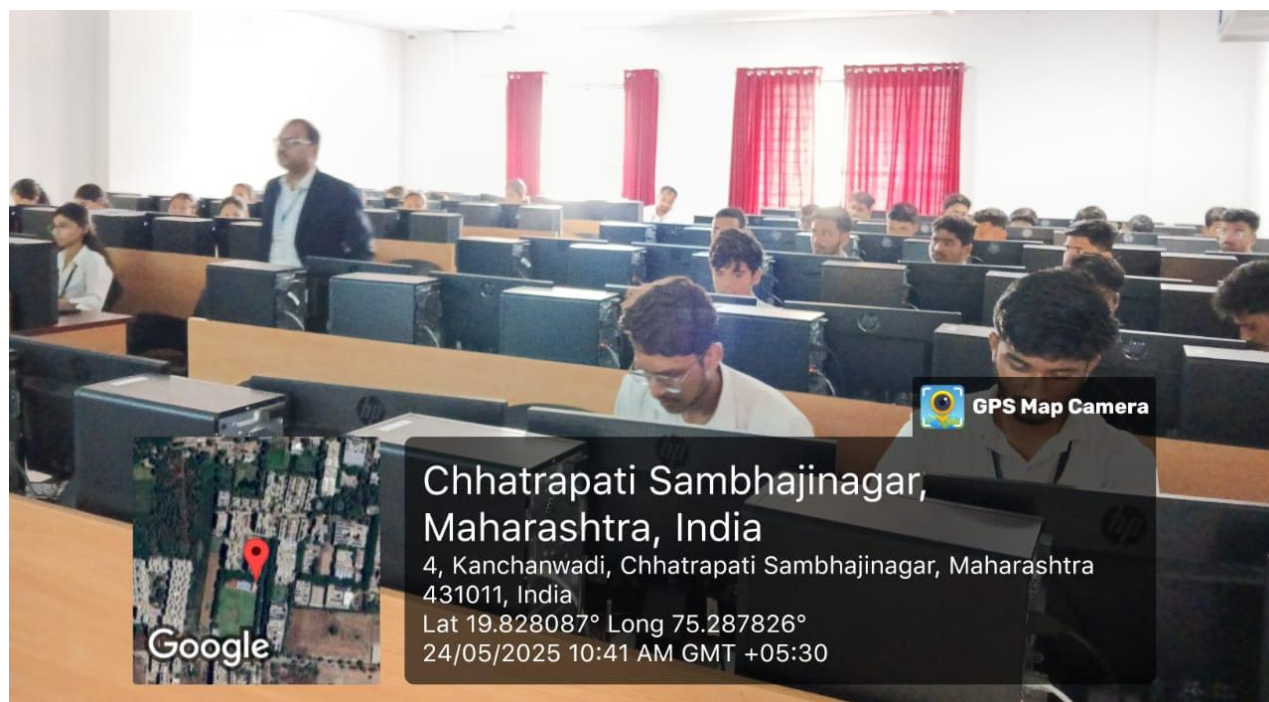
Participants and Speaker during the Expert Talk and hands-on session at B516, Smart Class Room

downloaded IEEE conference template and understand how to modify it with their contents to avoid mistakes in paper formatting. An overview of Overleaf is given to students for latex based and collaborative paper writing.