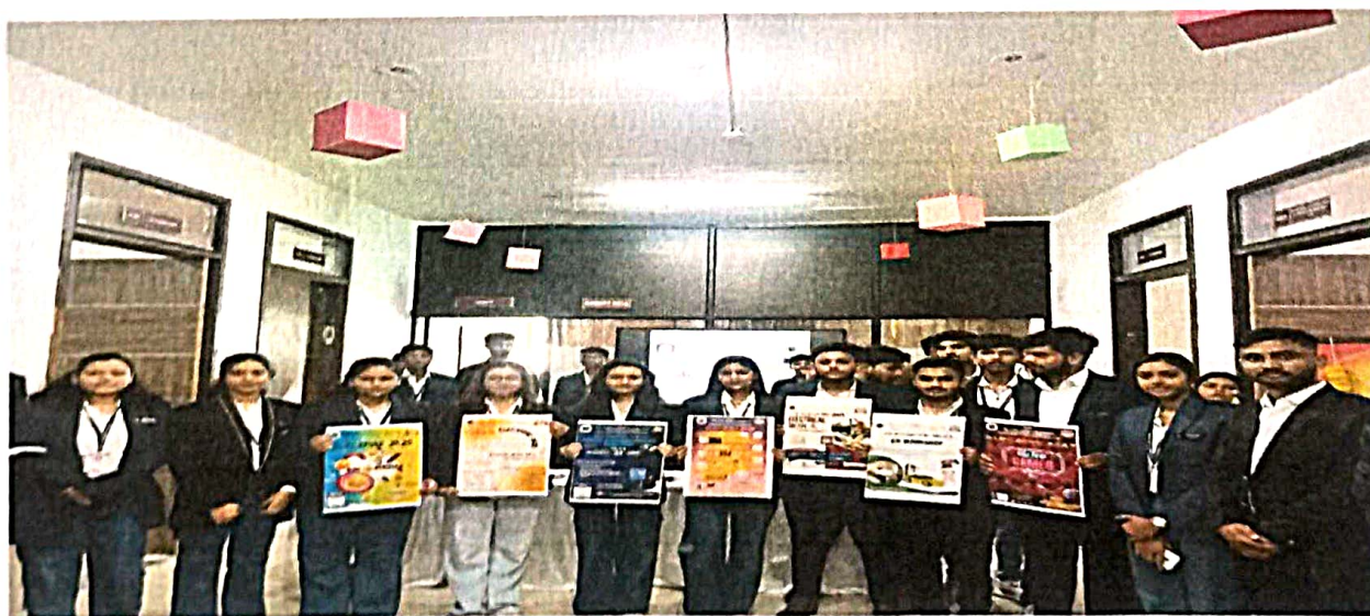
All event coordinators holding the event pamphlet in their hands