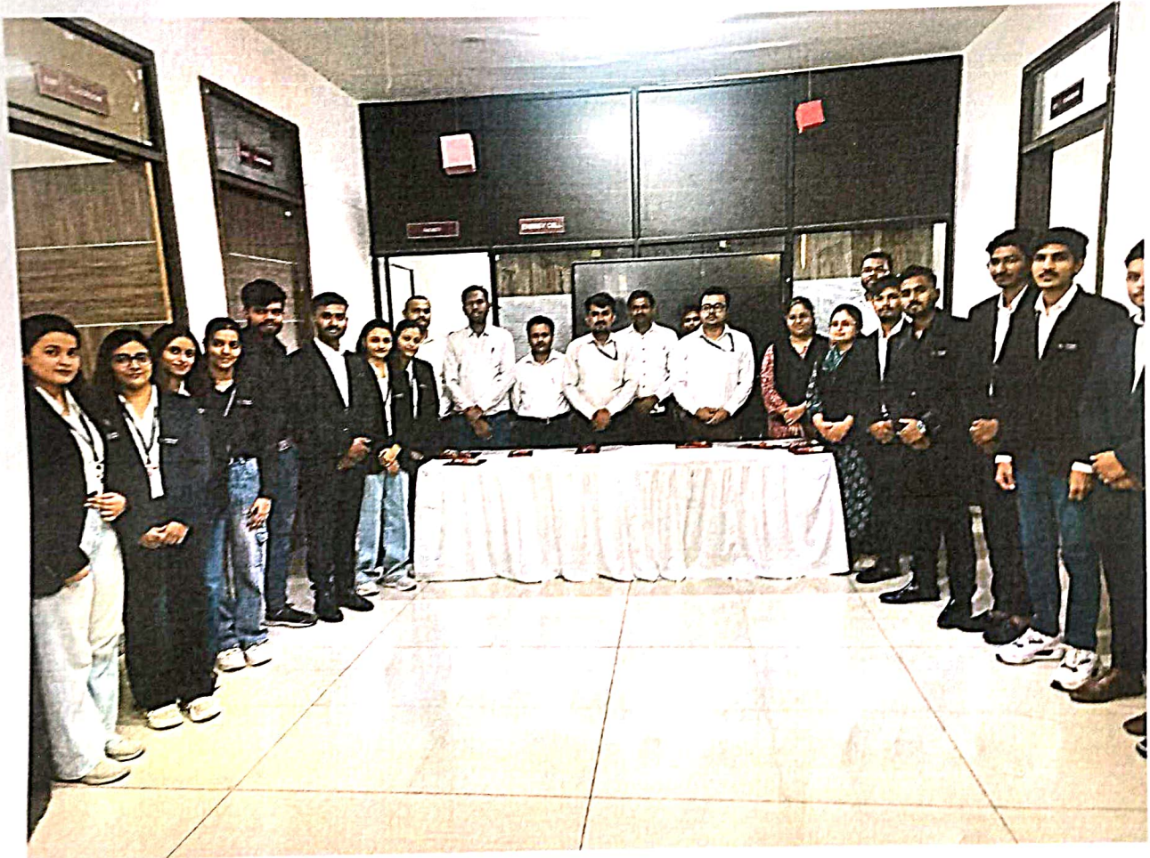
Valedictory Function of ELECSPIRE 2K25

Approved by AICTE New Delhi, DTE (Govt. of Maharashtra) and affiliated to Dr. BATU, Lonere (Raigad). DTE Code: 2533